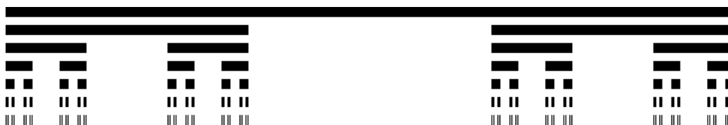
FIGURE 1. Example of set S_7 .

The Cantor set is constructed from the set of Real numbers in the unit interval [0, 1] . Lets call the initial set S_0 . For the first iteration a fraction \alpha is taken away from S_0 such that S_1 contains two disconnected sets of Real numbers [0, \frac{1}{2}(1 - \alpha)] and [1 - \frac{1}{2}(1 - \alpha), 1] . Lets a := \frac{1}{2}(1 - \alpha) and b := 1 - \frac{1}{2}(1 - \alpha) , and call [0, a] S_{1a} and [b, 1] S_{1b} . For the second iteration take away the fraction \alpha from S_{1a} and S_{1b} such that S_2 contains four disconnected sets of Real numbers [0, \frac{1}{2}(a - \alpha a)] , [a - \frac{1}{2}(a - \alpha a), a] , [b, b + \frac{1}{2}(a - \alpha a)] , and [1 - \frac{1}{2}(a - \alpha a), 1] . This is continued until S_{\infty} is reached, and S_{\infty} is called the Cantor set; more specifically the middle - \alpha Cantor set. Two illustrations are shown in Figure .